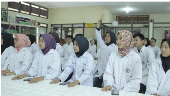
Figure 5. Students asking questions in a discussion session

According to Ango (2002) and Lepiyanto (2014) the emergence of student curiosity led to the emergence of indicators of science process skills in the form of asking questions., asking questions is one of the most commonly used science process skills. According to Zobisch et al. (2015) educators believe that to thrive in the 21st century, students must ask questions, challenge assumptions, and find new ways to solve problems, relate new knowledge to already known information, and apply their reasoning skills to new situations.