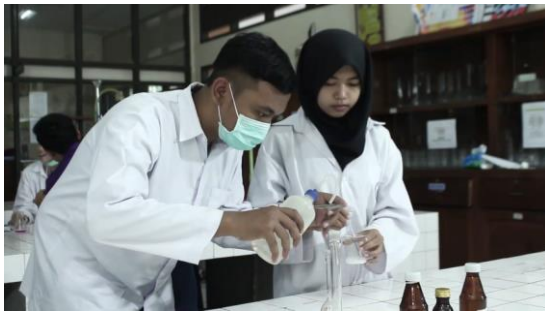
Figure 1. Students cooperate in practicum groups

Interpersonal intelligence is one of the intelligences that dominates the implementation of practicum because practicum is carried out in groups with two to three students in each group. With a small number of group members, the division of practicum tasks must be done as well as possible so that the practicum runs effectively and efficiently. Students who have interpersonal intelligence have characteristics like to work in groups, like to help friends in a group, and have good communication skills (Nisa et al. , 2019).