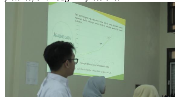
Figure 4. Students Interpret Experiment Result Data

Students then interpret the results of their observations on this experiment that had been carried out. Observations are useless if they are not interpreted. Therefore, from observing directly, then recording each observation separately, then connecting the results of those observations. The science process skill in interpreting the data for class 1 students in this experiment was 73.53% (high), while class 2 students were 74.22% (high). Individuals who have linguistic intelligence tend to have better communication skills than others (Amin, 2018). This is supported by the opinion of Agustina and Saputra (2016) which states that the ability to communicate is indispensable because humans interact with other humans through communication, either verbally, in writing, pictures, or through impressions.