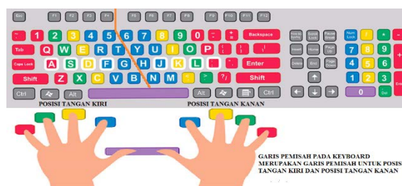
Figure 1. Typing Skills

The development of information and communication technology becomes the challenge of educational institutions especially vocational high school to be able to produce graduates who master the knowledge and skills related directly to office work. One of the skills that must be owned by graduates majoring in automatic expertise program and office governance is typing skills.