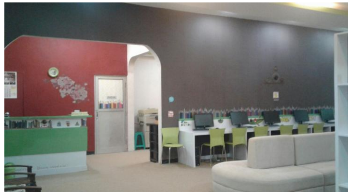
Figure 2. Facilities for Students