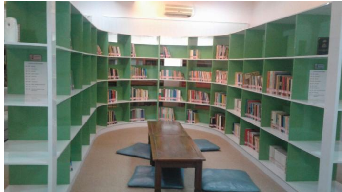
Figure 1. Reading Room

students to have their academic activities independently. The followings are some pictures of SAC.