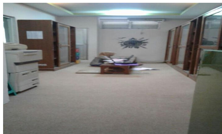
Figure 3. Independent Learning