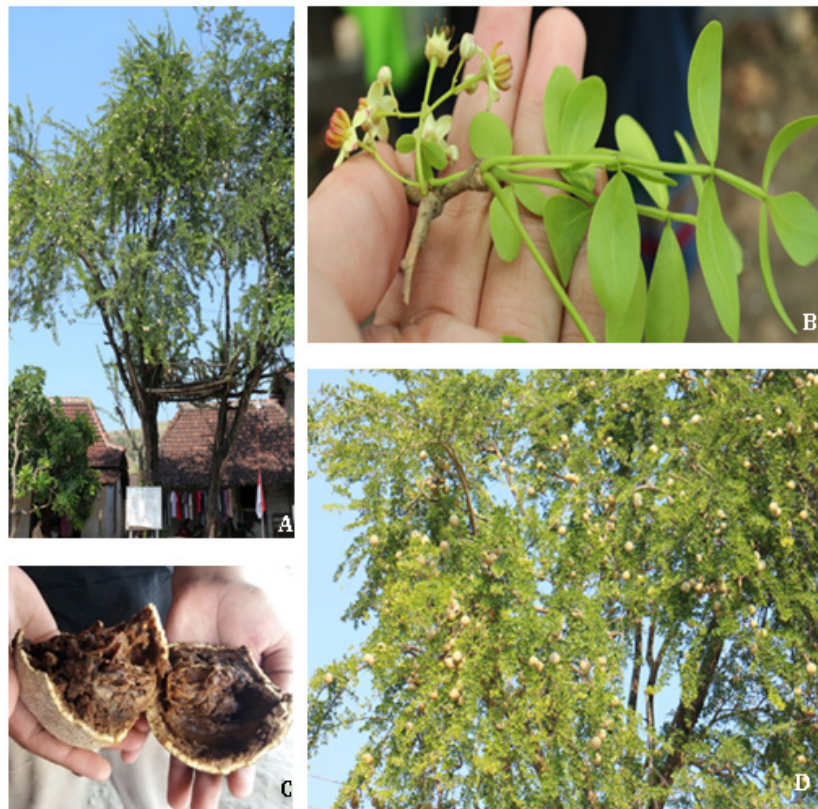
Figure 4. The morphology of wood apple. A. A tree grown at the yard at Sluke. B. The young leaves and flower. C. The pieces of ripe fruit shows brown fruit flesh. D. Fruits on the tree.

traditional knowledge of plants can be realized in the pattern of utilization of plants and traditional agriculture. Local people develop their traditional knowledge in a practical way in which they live. The phenomenon of traditional knowledge can be used as a conservation step (Luizza et al. , 2013).