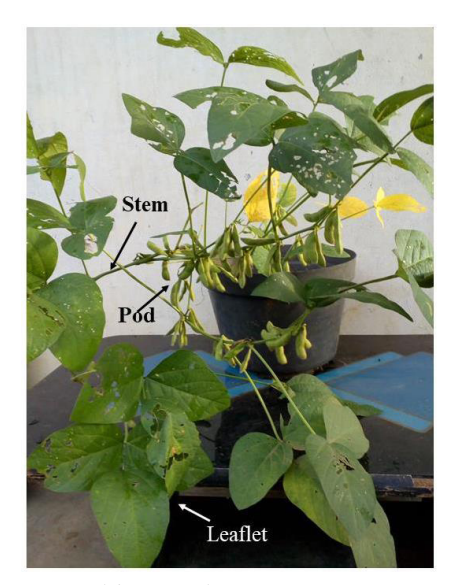
Figure 1 . Cultivar Mahameru at 0 mM NaCl, 60 days after planting.

The salinity treatment did not give a significant difference (p < 0.05) in the roots dry weight. The root dry weight at 0 mM NaCl was 0.51 g, and so do the root dry weight at 200 mM NaCl (Table 4). This result showed that Mahameru cultivar could survive in saline condition up to 200 mM NaCl. The soybean crops that grow in salinity stress will have their roots, and canopies dry weight decreased. Soybean crops inhibited growth are happened because of Na+ and Clthat toxic to plants accumulated (Kondetti et al., 2012). The soybean crops that treated at 50, 100, dan 200 mM NaCl salinity concentration will decrease in gross and dry weight, that is happened because of Na+ and Cl- ions accumulation in plant and affect it is growth (Amirjani, 2010)