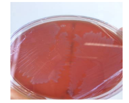
Figure 3. Pathogenicity Test of Endophytic Bacteria

The method that used in this research is KirbyBauer disc method. Parameters that used to determine the ability of antibacterial power was to measure the area of inhibit zone that occured around the paper disc. Tests of antibacterial activity were positive when around of the paper discs had clear zones that were free from bac-