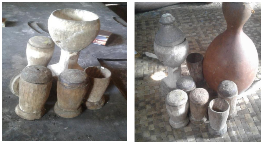
Figure 4. Handicrafts in the form of drinking sopi/moke tools made of Gyrinops versteegii wood on the island of Flores

of agarwood plant plus a mixture of other spices (19 types of spices). The agarwood farmer has also attended training from the Indonesian Food and Drug Research Institute (BPOM), and now his traditional medicine is in the process of making a permit. One pack of liniment is sold for around 30 to 50 thousand rupiah. In addition to liniment, the farmer also makes handicrafts from G. versteegii wood in the form of a set of glasses and others (Figure 4) which are used to serve guests typical Flores drinks (moke/ sopi). From this explanation, it can be concluded that agarwood plays an important role in the source of livelihood for some residents of the Flores community. The utilization of Gyrinops versteegii in Sumbawa tends to have fewer uses apart from its wood for sale. In Sumbawa, it is known to be used as traditional medicine however this information is lacking in the literature (Sukenti & Mulyaningsih, 2019).