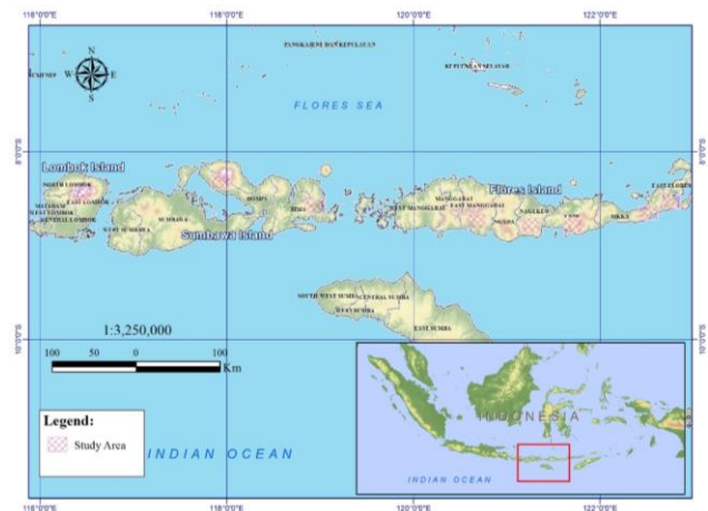
Figure 1. Field study locations to record Gyrinops versteegii data.

Field exploration was conducted on 2018 and 2019 in NTB and NTT (Figure 1) to find out the latest distribution of both cultivated and natural G. versteegii . Handheld Garmin GPS was used to record the geographic coordinates of G. versteegii . Specimens (evidence of exploration) were stored in the Herbarium Hortus Botanicus Baliensis , “Eka Karya” Bali Botanical Garden in Bedugul. An ethnobotanical note of G. versteegii from the field was obtained by conducting open interview to key informant.