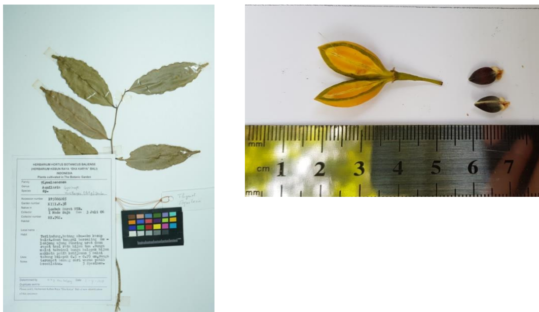
Figure 2. Herbarium Gyrinops versteegii in the Hortus Botanicus Baliensis (Left); Gyrinops versteegii fruit and seeds from exploration on Lombok Island, NTB 2018 (right)

The descriptions of the living and herbarium collections (Figure 2) from Gyrinops versteegii at the Bali Botanic Garden show the following descriptions: The stems are brown, sometimes some are white; tree height can reach 12 m; the leaf size is about 4 cm wide by about 13 cm long; single leaf; incomplete leaves; alternate leaves; the edges of the leaves are flat; elongated leaf shape; the tip of the leaf is tapered; dark green leaf color; glossy smooth leaf surface; flowers in tubular or funnel-shaped with 5-6 crowns; axillary flower; panicles; androgynous flower. The fruit is oval and fleshy (Figure 2). The color of the young fruit is green, after being old it becomes reddish yellow, and will break off by itself.