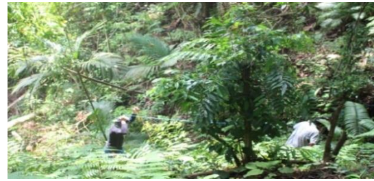
Figure 3. Field exploration activities to determine the distribution and population of Gyrinops versteegii in NTB and NTT. Making a plot at the location in which G. versteegii was found.

moisture, sunlight intensity, and air temperature (Roemantyo & Partomihardjo, 2010; Sitepu et al., 2011; Sutomo & Oktavia, 2019). Refer to Yulistyarini et al. (2020), the distribution of G. versteegii has a strong correlation between the content of C organic and Soil Organic Matter (SOM) in Manggarai - Flores. This condition makes an indication that the preference location of G. versteegii is the fertile soil naturally.