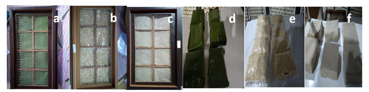
Figure 2. Tempeh with three types of packaging. using innovative incubators with leaf packaging (a); using innovative incubators with using innovative incubators with paper packaging (b); using innovative incubators with plastic packaging (c); leaf packaging control (d); plastic packaging control (e); paper packaging control (f)