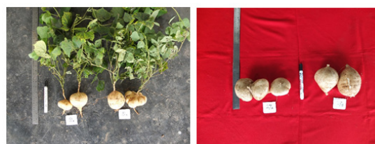
Figure 2. Variability on tuber shape of yam bean accessions

tuber weight, it was successfully obtained five clusters (Table 3, Figure 3). Cluster I included 18 accessions of tubers with quite low tuber weight (420-583.33 g/plant). Cluster II consisted of 14 accessions of tubers with medium tuber weight (640-793.33 g/plant). Then, cluster III was consisted of four accessions with quite heavy tuber weight (860-1003.33 g/plant). Cluster IV was a group with the most number of members, i.e. 34 accessions. Cluster IV was characterized by low tuber weight (35-365 g/plant). The last cluster which consisted of three accessions was characterized by very heavy tuber weight (1223.33-1360 g/plant).