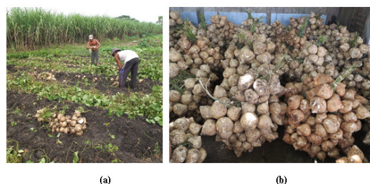
Figure 1. (a) Yam bean harvest in farmers' field; (b) Yam bean tuber in collecting trader

Yam bean ( Pachyrhizus erosus (L) Urban) is a legume root crops and potential commodity in Indonesia due to its valuable profit and income for the farmers. Historical evidences explained that yam bean was belonging to the Leguminosae family that originated from Mexico and north of Central America. Then, yam bean was introduced to Philippine by Spain and spreading to many countries in South-East Asia including Indonesia (Sorensen,1996; Grüneberg et al. , 1999). Nowadays, the production centers of yam bean in Indonesia are spreading in some areas (Karuniawan, 2004; Damayanti, 2010).