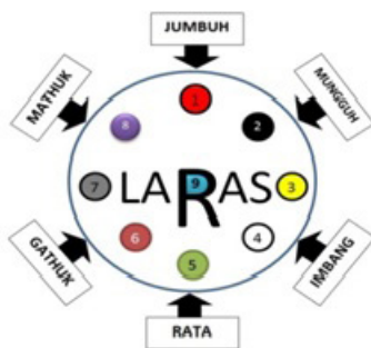
Figure 3. Laras , the aspects, and factors that cause its manifestations

something evil, they will lose their luck. Besides the idioms mentioned above, there are still other idioms that illustrate the importance of having a balance life, such as: Sepi jroning rame means in a lonely state, there is a crowd; susah jroning bungah , inside the sadness there is happiness; peteng jroning padhang , in every darkness, there is a light; becik jroning ala , there is goodness in every bad things. The meaning behind the revious explanation is that in every condition there will be always another condition. These conditions can happened alternately at anytime. Balance is laras determinants. It is a wonderful, deep, and thorough sense of intrinsic. The schematic illustration of the conception of laras , along with the forming elements as well as the factors causing the manifestation to happen, is presented in the following scheme: