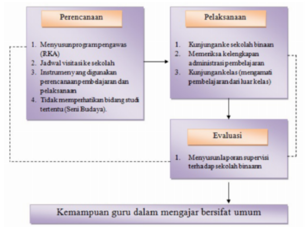
Figure 1. The Factual Model of the Academic Supervision Implementation