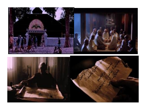
Figure 2. Artistic Management in the Cinematic Aspect of Sang Pencerah Film

is set based on local perspective. This thematic side is motivated by Javanese local belief. According to semiotic perspective of Pierce (Short, 2007, p. 214), the nuance of brown color which is shown in almost the entire film is the index of old periodical in Javanese space and time. In Javanese philosophy itself, the brown nuance as shown in the film is interpreted as kesejagatan or the universe that is based on the value of manungsa (people), jagad (universe), and gusti Alloh (the Creator).