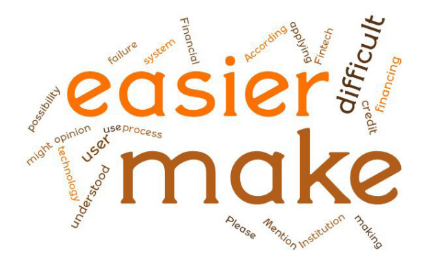
Figure 3 . Responses to technology use in applying for credit according to Informants

Meanwhile, in terms of technology application, and they are asked whether they used Technology Application in the process of applying loans to Financial Institution or Fintech, there are 5 respondents said "yes", and 42 respondents said "no". Then when they are asked whether the use of technology in applying for loans is making it easier or more difficult, mostly respondents stated "make it easier". From these findings, we can state that although for some extend, the respondents have not used the technology application in the process. However, they seem to be very confident that by implementing the use of financial technology, the process of loans would be made more accessible. This statement has been confirmed by word-clouds presented in Figure 3 as follows: