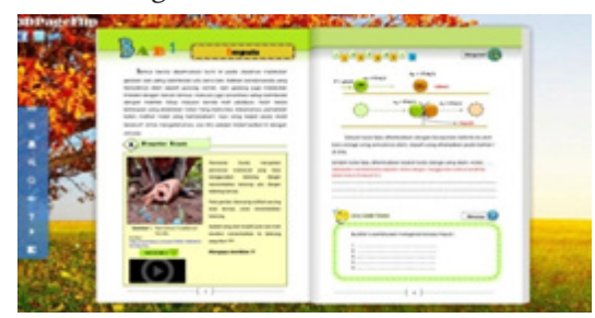
Figure 2. The Display of 3D PageFlipp Work-sheet

The 3D Page-Flipped Worksheet was developed on the basis of expert validators' evaluations in the content, language, and design. The final validation results of the product are shown in Table 5.