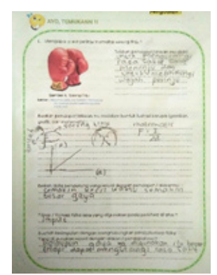
Figure 5. The Student A's Answers

The researchers took two samples of answers from Student A and Student B, as displayed in the following figures.