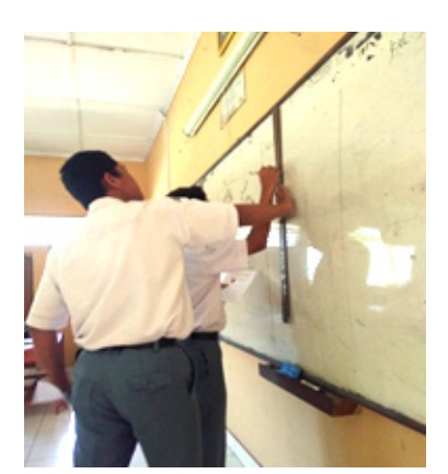
Figure 4. Presentation Activity

Representations used by the students during a presentation were pictures and graphics. Some of the complicated and challenging physics concepts were represented using mathematical representation/verbal, but it became more comfortable when they employed photographs or diagrams. This fact is line with Ainsworth et al. (2011) who stated that particular representation image/visual is useful to help visualize abstract concepts. In other words, the use of 3D Page-