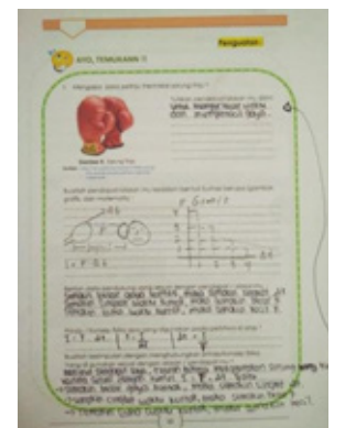
Figure 6. The Student B's Answers

ved including (1) visual understanding; (2) visual fluency; (3) the connectional comprehension; and (4) the connectional fluency. Student A was able to construct three forms of representation, i.e., images, graphics, and mathematics. However, the types of representation written by student A have not yet built the concept of impulse and momentum. Descriptions for each representation were irrelevant as they have not accomplished the four elements. Instead, the representational image given by student A should provide a visual understanding of the impulse concept for then connected to other mapping concepts. Impulse is influenced by two quantities, i.e., contact force (F) and time interval ( \Delta t ), which are then developed into the graph. Therefore, the chart has to depict the relationship between contact force (F) and time interval ( \Delta t ).