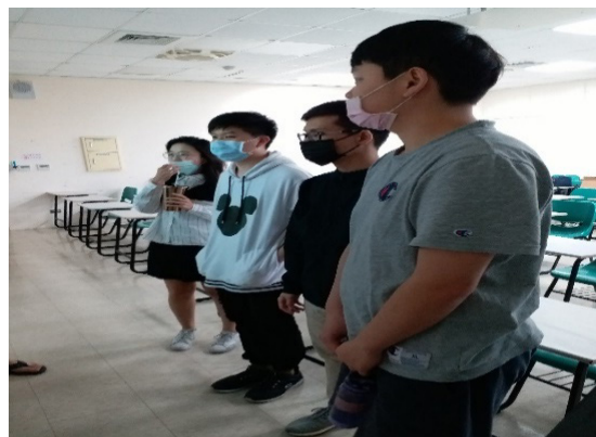
Figure 2. Students Following a Discussion During Break Time

this time to ask questions about holography and Michelson's experiment at the whiteboard. At some point, they were saying, "Teacher, this is the most interesting part of this class," as shown in Figure 2.