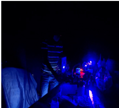
Figure 4. Teacher Demonstrates to Students Michelson's Experiment

During the third week, the students went back to the lab to perform Michelson's experiment. The experiment was first demonstrated, and then they carried it out by themselves. Just as in the holography experiment, they talked, assisted one another in adjusting the optical components, and recalled the essential steps in experimenting. Once they were able to visualize the phenomena, they did not hide their joy—they were so happy. One student who had no physics background was excited and said, “ I do not regret choosing this course; I have learnt a lot from it. ” Figure 4 shows a demonstration of the phenomenon of Michelson's experiment.