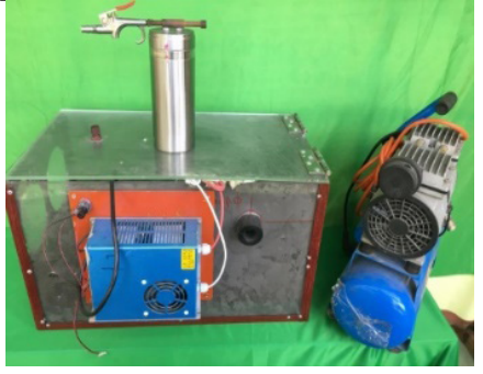
Figure 3. A Complete Set of Students' Electrostatic Painting Equipment

Figure 3 demonstrated a complete set of students' electrostatic painting equipment, including a spray gun, a pump, and a box to place the object to paint. The high voltage power source was from Van De Graff electrostatic generators, which produced another STEM project of the same group of researchers. Detailed information about this type of electrostatic generator can be found in Ghosh (2021). The pump was shared in groups to minimize the cost of the project.