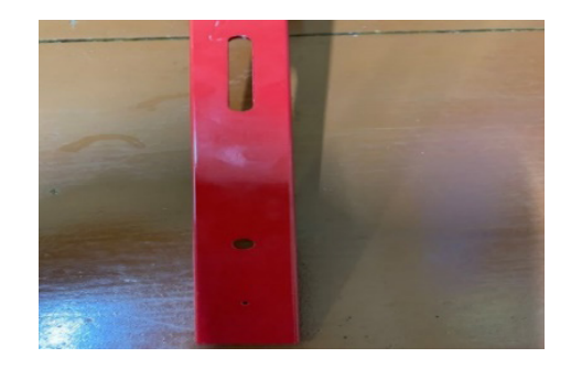
Figure 5. A Sample Tested Object

Tested result: The material was wellpainted with a smooth surface and durable, as shown in Figure 5. Some painted samples were unsatisfied as the spray paint was not smooth due to the ineffective air blow designs.