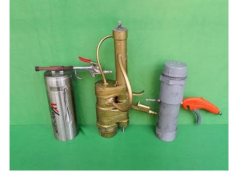
Figure 2. Some Samples of Students' Electrostatic Spray Guns

designs. All of them were made from recycled material and things that the students found at home and local recycled stores.