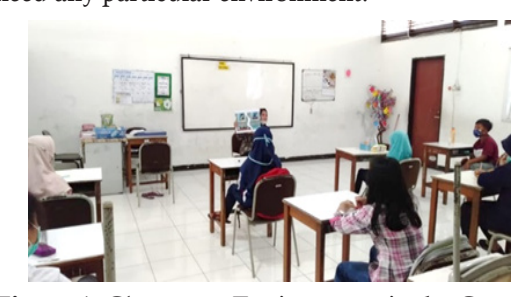
Figure 4. Classroom Environment in the Control Group

The room arrangement for the Kamiholo experiment is held in Multimedia Room as its implementation needs a darker room, as in Figure 3. Meanwhile, the ordinary classroom, as in Figure 4, is used for the Kamishibai experiment because the Kamishibai implementation does not need any particular environment.