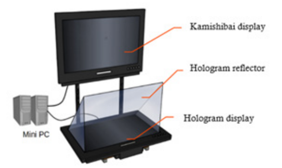
Figure 2. Kamiholo System

We have explained the development stages of Kamiholo in our previous research (Hernawan et al., 2021). The Kamiholo media uses two monitors. The first monitor is positioned perpendicular to the viewer and is used to display the Kamishibai. The Kamishibai images used in this study are not printed on cards like the conventional Kamishibai but displayed on a monitor screen. The second monitor is laid at the bottom, as in Figure 2. The second monitor displays holographic images that will be reflected on the holographic reflector stored above it.