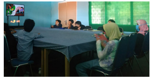
Figure 3. Classroom Environment in the Experiment Group

In this study, the class action research method is used. The experiment is conducted on fifthgrade students at Labschool UPI Cibiru Elementary School. The participants include 50 students, selected randomly and divided into experimental and control groups with the same number of students in each group. The experimental group is given the learning treatment using Kamiholo, while the control is given the learning treatment using conventional Kamishibai. The large groups are further divided into two smaller groups with equal numbers to maintain the COVID-19 health protocol because the experiment is carried out during the pandemic. In addition, this is also done to calibrate the intensity of the learning process. However, the results of this experiment are maintained because the delivery and implementation of the experiments are still carried out using the same procedure. The steps, materials, and narration given to the two groups are the same and follow the same lesson plans.