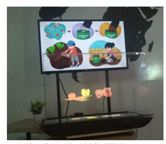
Figure 1. Kamiholo: Kamishibai Hologram

We have explained the development stages of Kamiholo in our previous research (Hernawan et al., 2021). The Kamiholo media uses two monitors. The first monitor is positioned perpendicular to the viewer and is used to display the Kamishibai. The Kamishibai images used in this study are not printed on cards like the conventional Kamishibai but displayed on a monitor screen. The second monitor is laid at the bottom, as in Figure 2. The second monitor displays holographic images that will be reflected on the holographic reflector stored above it.