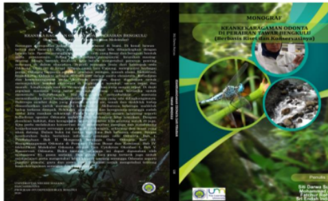
Figure 1. Monograph Book

The monograph used in this experiment is a monograph on the diversity of Odonata from Bengkulu freshwater (Figure 1). This monograph contains factual, conceptual, and procedural knowledge of the diversity of Odonata constructed from the results of research and studies of relevant literature. This monograph went through a process of construct validation by a team of experts and a small empirical validation. The monograph consists of an introductory unit, problems, problem-solving methods, benefits of Odonata, diversity of Odonata in Bengkulu, molecular identification, and