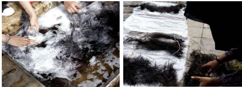
FIGURE 1. Palm fiber cleaning process

The manufacture of test objects is carried out after the results of basic testing of the material are obtained. Curing time is carried out until the life of the pozzolan brick compressive strength test plan reaches a lifespan of 28 days by storing the test object at a humid room temperature. Here are some photos of documentation conducting the test.