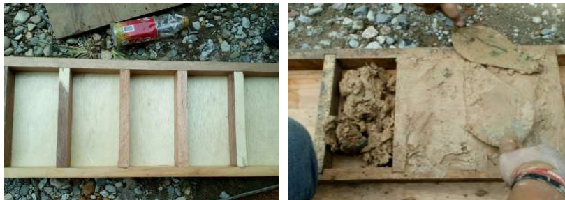
FIGURE 2. Pozzolan brick molding process.