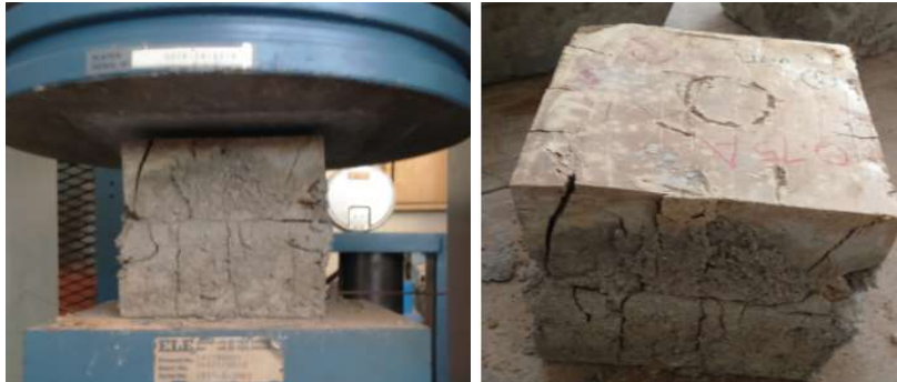
FIGURE 4. Pozzolan brick compressive strength test process

The image below is documentation when conducting a compressive strength test of the pozzolan brick