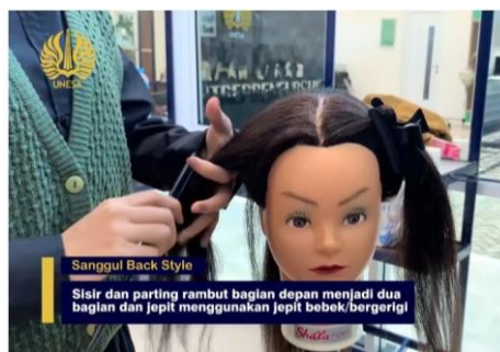
Picture 2. The Video from Android Smartphone to Teach Modern Hair Bun

In the picture above is a cover on an Android smartphone that is used in implementing the community service for the students of Class XII, Cosmetology department, State Vocational High School 8 Surabaya.