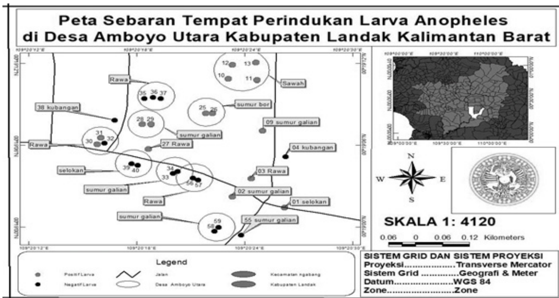
Figure 2. Map of Distribution of Breeding Places in Area with High Malaria Cases in North Amboyo Village, Ngabang Subdistrict, Landak Regency, 2018

mapping of breeding places distribution according to breeding places showed p=0.001 which meant that the clustering was significant. When there were cases of malaria near the cluster, there would be an increase in risk of malaria transmission in that cluster area.