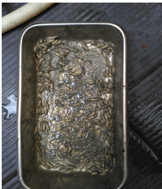
Figure 1. Breeding of Bowfly larvae into instar larvae III

Garlic extract was made using two methods, namely maceration and extraction methods. Two kg was cleaned using clean water and then it was finely chopped. After chopping, the garlic was dried at room temperature and was protected from direct sunlight, then blended. On mashed garlic powder, maceration was done by soaking with 96% ethanol solution. Garlic powder was soaked (macerated) until perfectly submerged for 3 x 24 hours. After 3 x 24 hours, the solution was filtered with filter paper using a Buchner funnel and cotton and then it was placed in a dark bottle. The pulp from the first filtering result was soaked again for 1 x 24 hours and then filtered and the same thing was done on the second and third immersion. The next step was extraction of macerated garlic solution using an equipment called Vacuum Rotary Evaporator to produce a concentrated brown extract. The extract was stored in a refrigerator until usage.