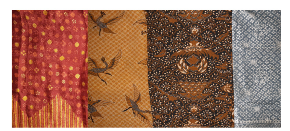
Figure 1. Batik textile (hand drawn and stemped batik)

The KBL tourism has been developed participation of batik merchant community, such as Development Batik Kampung Laweyan Forum Community, "Forum Pengembangan Kampoeng Batik Laweyan (FPKBL)" (Hanida,2009), (Kusuma, 2015). Batik merchant communities, such as FPKBL, run batik businesses as a legacy from their ancestors. Batik is the most popular icon of Indonesian culture for a long history (Wahyono,2014). Batik can be identified by how it is made, which consists of hand-drawn batik tulis (written batik literally meaning), batik cap (stamped batik) and printed batik (Figure 1).