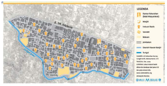
Figure 3. Kampung Batik Laweyan Map and Batik Producer Location (rectangle dot). (Solokotakita, 2010)

The activities of the batik merchant community at KBL are considered as and tourists. attractions for visitors Therefore, the activities of the batik merchant community at KBL show a modern batik merchant day use of elements of the past (Kusuma,2015), which is continually adapting new practices but still preserving past established kampong local culture. Currently the area of KBL at Surakarta City is 24.83 ha wide (Figure 2). The total population of KBL has more than citizens (pariwisatasolo.surakarta. go.id). Most of them are batik producers, batik merchants, sub-producers of batik, and batik artisans and they are active members of the batik merchant community FPKBL (Figure 3).