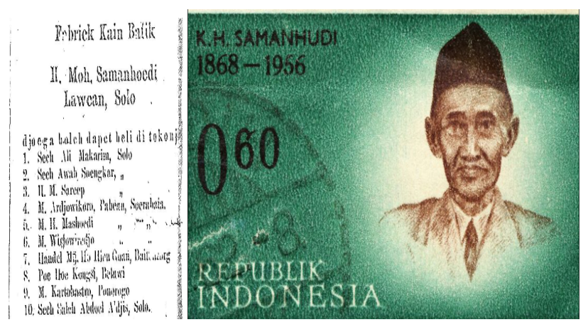
Figure. 5. Advertisement Batik Merchant Samanhoedi anno 1916, (Poster display collection of Roemahkoe Heritage Hotel. Laweyan, Surakarta). and Republic Indonesia Stamp of Samahoedi (shutterstock.com)

tourist attractions and call for the millennial visitors to experience historical reenactments of the glorious batik merchants of KBL.