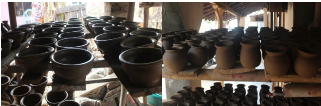
Figure 2. The Natural Dying Process By allowing the wind to dye it in the terrace