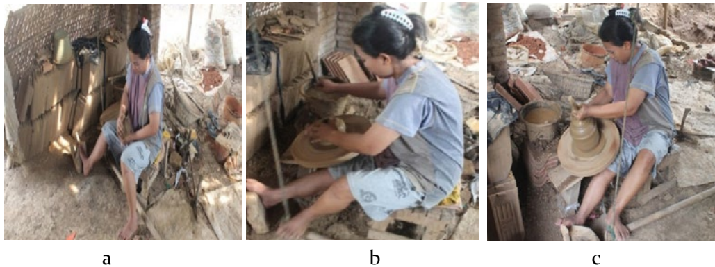
Figure 1. The Making Process of Ceramic using Rotational Techniques ( mbubut ) Typical from Mayong Lor Village

The forming process is completed by smoothing the lips (edge) part of the products with a dampened cloth or sponge and the bottom part attached to the bucket is cut with wire or yarn. The products are then removed to dry in the shade. If the ceramics will be given additional decoration, then before drying process or in a semi-dry (Javanese: malem ), it can be done by scratching, carving, sticking, stamping or punching the ceramic body according to the motif or decorative pattern that has been prepared before. In addition, there are times when, in a semi-dry state, ceramics are beautified by craftsmen by giving the coating of engobe (a coloring materials from red ground pulp) on the entire surface of the pottery by brushing it until it is evenly distributed. The next pro-