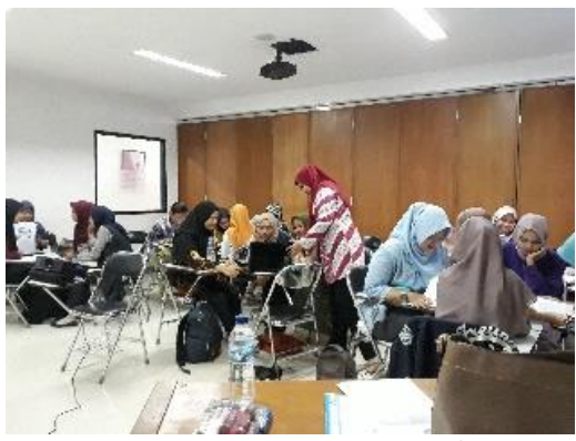
Figure 3. Guidance and explanation from the lecturers