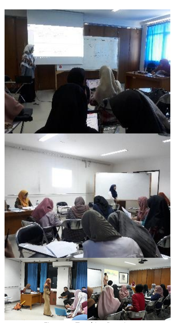
Figurer 4. Teaching Practice

The next procedure in Lesson Study is the reflection (reflection/ see) on the planning and implementation of teaching-learning/ practice, to improve the quality of learning carried out by students. This process allows students to repack