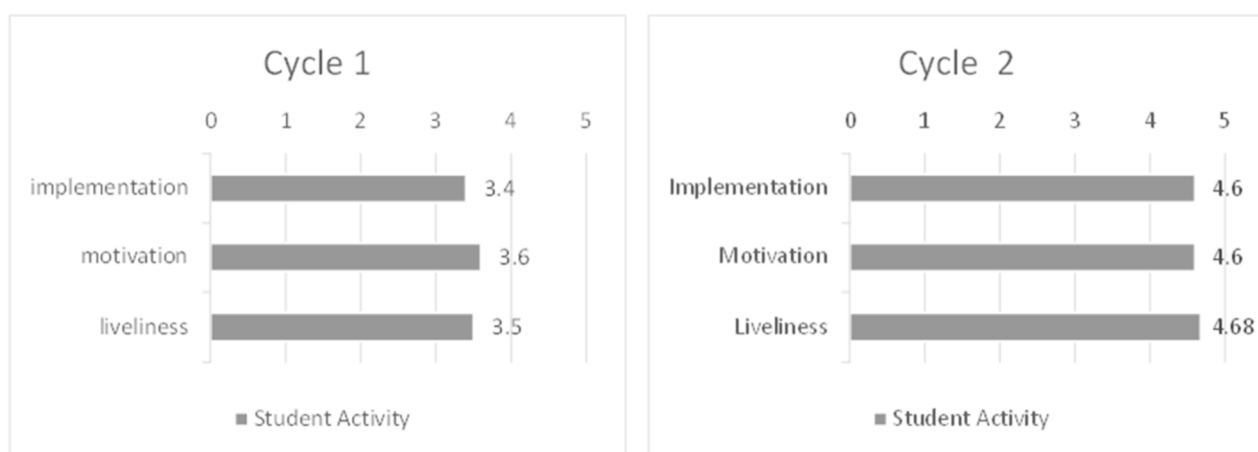
Figure 2. Comparison of student learning activities in Cycle 1 and Cycle 2

about values Nosampesuvu can provide benefits for the formation of character for students, because the values NoSampesuvu Material taught at SMA Negeri 2 Sigi are very beneficial for students in undergoing activities in school, in the community and disrespectful, polite and cooperate in terms of help sincerely. Thus, local wisdom Nosampesuvu in the form of tolerance values ( Mosipahami Patuju ) which is integrated in history learning can be a conflict resolution through learning activities for students in the first semester specialization class class X.