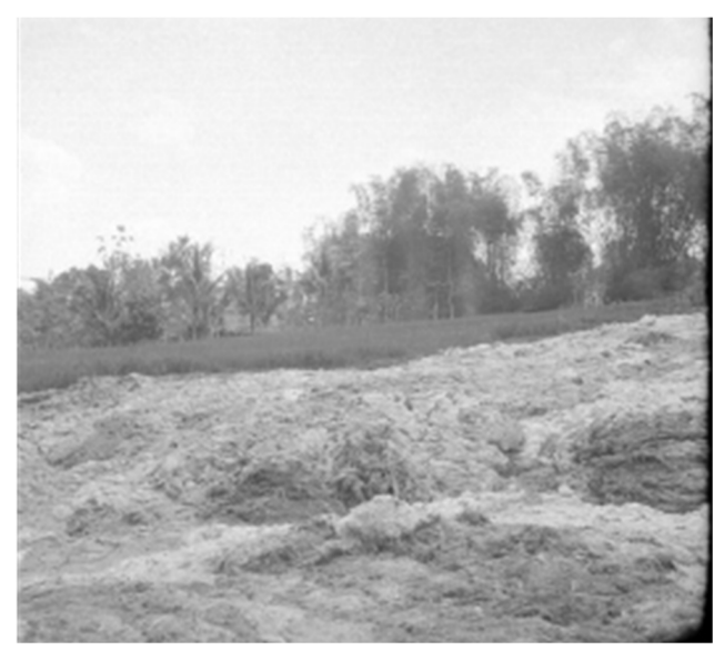
Figure 6. Plants that Live in the Highlands

Coffee plants do not need many protective plants when still teenagers or adults. Protective plants were getting reduced; thus, there was a shift in the plants in the Mento Toelakan plantation. Other plants already exist in the area were gradually being evicted to grow coffee cultivation. The opening of the Mento Toelakan plantation may have started from the north side of the area. It is referred to in terms of the contours of the Mento Toelakan area, which were very diverse. The northern area of Mento Toelakan was a sloped area of Mount Lawu, which had a higher contour when compared to other areas. The coffee plantations on the north were probably mountainous areas, and the supporting plants were on the south side of the plantations.