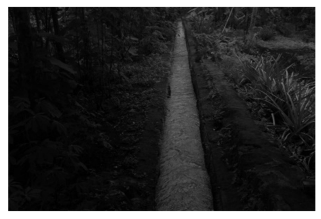
Figure 12. Irrigation Channels in Mento Toelakan

in Wonogiri. One of the most visible and felt impacts was the onset of flooding in several areas. Whereas previously there had never been any reports of flooding, flooding has occurred since the forest's function has changed.