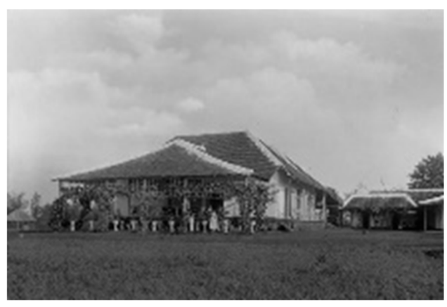
Figure 7. Mento Toelakan Plantation Administrator's Office