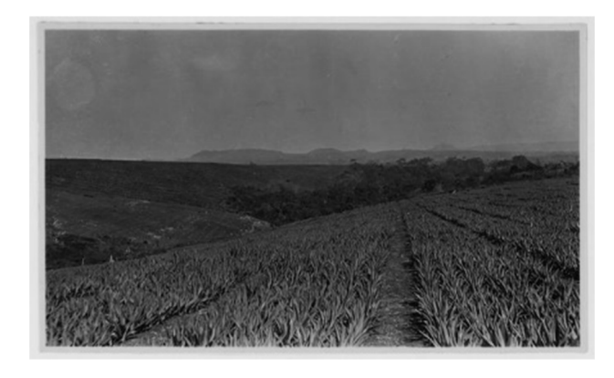
Figure 4. Condition in northern Mento Toelakan, circa 1930

Mento Toelakan was planted with coffee, and other crops such as sugar cane, pepper and tobacco were added. Coffee dominated the early plantations