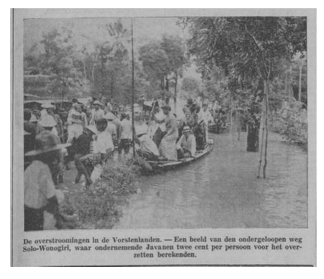
Figure 11. Flood in Wonogiri 1937

The 1937 flood showed evidence of the real impact of ongoing deforestation in Wonogiri. This flood caused the paralysis of transportation routes from Wonogiri to Sukoharjo or Solo. One of the affected points was the area around Mento Toelakan because this area was in the Wonogiri-Sukoharjo border area. In addition, changes in the Wonogiri forest directly impacted the environment