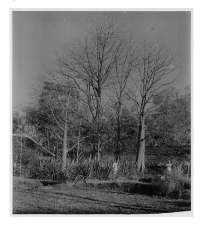
Figure 8. Kapok in Mento Toelakan Plantation.

Plantation land became a magnet that attracted Europeans or Indos (Eurasian) to live at Mento Toelakan. Europeans or Indos settled and married local people. Some of the evidence is the family grave and also the family tree. Europeans and Indos residing in Mento Toelakan lived in groups near the administrator's office, commonly