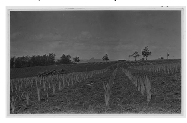
Figure 10. The Condition of Mento Toelakan Plantation during Agave Sp. Regeneration

Exploited land had an impact on the environ-