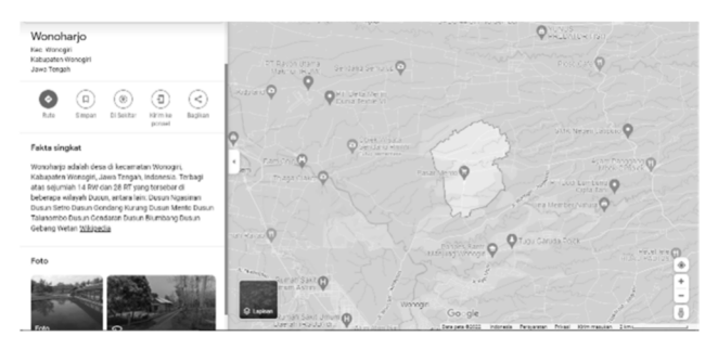
Figure 1. Map of Wonoharjo Village.

to generation (Pradita et al., 2021, pp. 110-112).