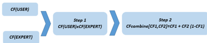
Figure 1. The step of the of method

Certainty Factor (CF) method is a method used to accommodate the inexact reasoning of an expert. An expert (such as a doctor) often analyzes the information available with an expression with uncertainty, to accommodate this we use CF to describe the level of expert confidence in the problem at hands[12]. In expressing the degree of certainty, CF assumes the degree of certainty of an expert on a data [2]. The following is a description of some combinations of Certainty Factor for various conditions [2, 13-15]: