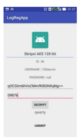
Figure 4. The interface of password ciphertext in decryption