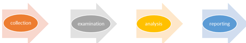
Figure 1. The NIST method for mobile forensic stages

Digital forensic aims to analyze and reconstruct an event related to a computer or digital artifact [17]. Digital forensic methods and processes have been developed by forensic investigators and practitioners [18]. This study applies a method for the National Institute of Standards and Technology (NIST) which is a forensic method for analyzing digital evidence on a smartphone media [19]. The flow of the NIST method as shown in Figure 1.