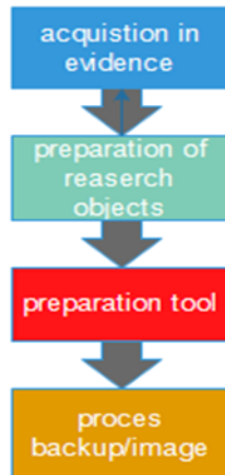
Figure 2. Collection process