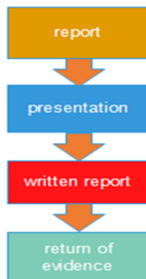
Figure 5. Reporting Process

The final result of an analysis process is a report. Reports from an analysis can be in the form of written reports needed as reports for documentation or oral reports in the form of presentations. The reporting process is explained in a groove like Figure 5.