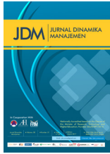
TABLE OF CONTENTS Volume 6. Number 2. September 2015