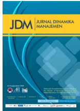
TABLE OF CONTENTS Volume 5. Number 2. September 2014