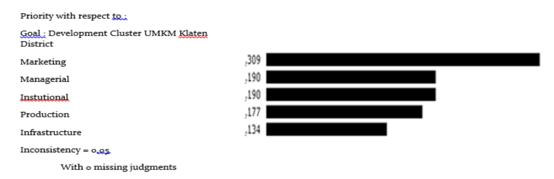
Figure 1. Analysis of the main Aspects in the development of metal casting Small Medium Enterprises cluster development in the village of Batur Ceper Subdistrict Klaten Regency.

Overall, based on the results of the analysis in order to cluster development SMEs Ceper Subdistrict in metal casting according to respondents have a similar view of the main aspects related that should be enhanced i.e. aspects of marketing. According to the cluster