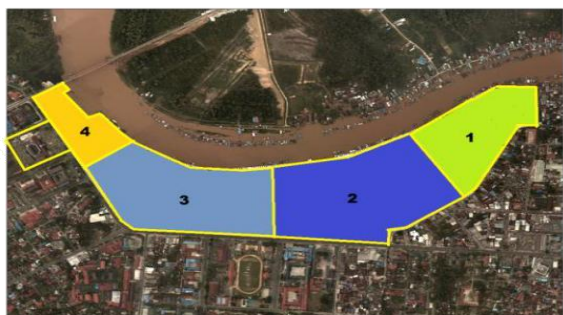
Figure 1. Zoning Plan of Plamboyan Region

When it viewed from the position of the zero points Palangka Raya City located on the left side of the area close to the Kahayan Bridge. While the natural zone placed on the right, and followed with the cultural zone. The next position of the cultural zone denoted the commercial business. The final location signified Sukarno Monument located in a municipal-memorial zone. The image map of the zone division can be seen in the following figure.