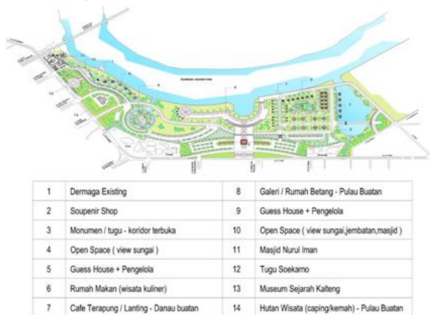
Figure 2. Waterfront City City Design in Palangka Raya City

Municipal Zone; This zone is provided as a government-related zone because in this zone there is a Sukarno Monument (a monument to the zero point of Palangka Raya City); Formal Parks (because they are formal areas); and open space (open space for city activities).