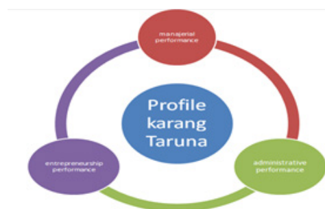
Figure 1. Variables of Profile Karang Taruna

The variables of profile Karang taruna can be seen at the Figure 1.