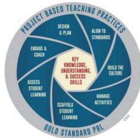
Figure 2. Gold Standard as one of the Project Based Learning models