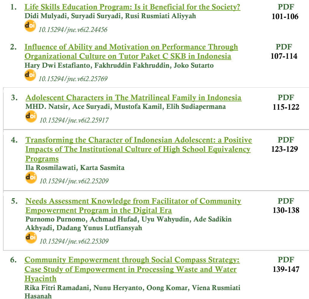
TABLE OF CONTENTS ARTICLES

The Journal of Nonformal Education is an international research journal with open access, a journal supported by a board of experts from various countries.