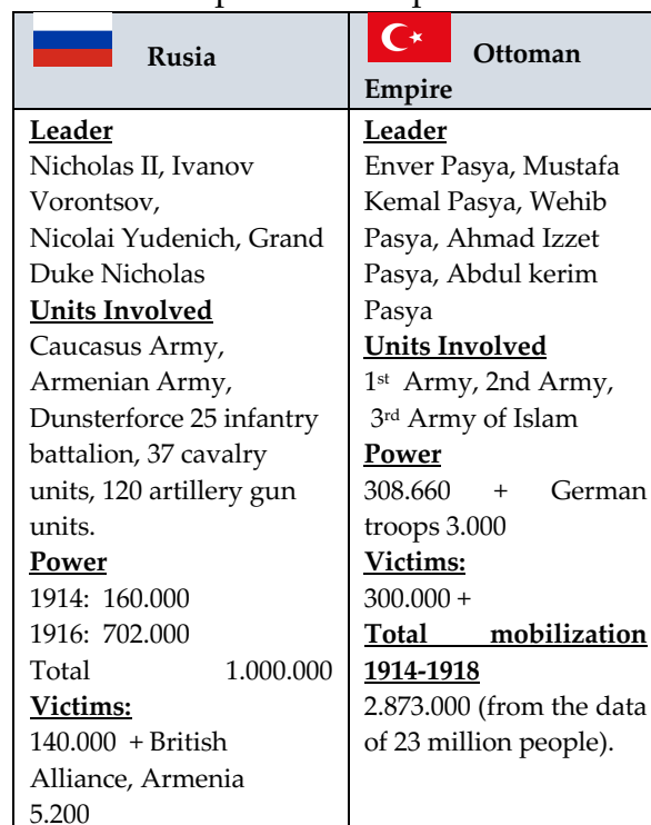
Figure 2. Strength and mobilization of the Ottoman Empire and the power of Russia

Source: Erickson, Edward J. (2007) and Mehmed Besicky (2012).