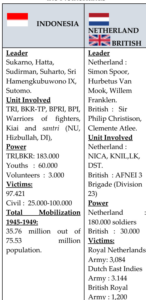
Figure 3. Strength and mobilization of the Indonesian people and the power of the Netherlands

and on the British and Dutch sides. According to the article "Imperial and Global Forum-Exeter University" and the July 27, 2017, edition of the magazine "De Groene Amsterdammer", the number of Indonesian fighters who died during the 1945-1949 War of Independence was 97,421. Data from the Central Statistics Agency states that the total population of Indonesia in 1940 was 70,112,000 people with an increase of 1.5% (bappenas.go.id), thus based on calculations with an average increase of 1.5% per year, in 1945 when the Independence Revolution began, the population of Indonesia was 75,530,535 million people. According to Kevin W. Fogg, Lecturer and Researcher at the Carolina Asia Center, University of North Carolina in the Series 3 Cultural Discussion Forum conducted by the Center for Community and Cultural Research (FDB) stated that in the History of the Indonesian Revolution, half of the Indonesian Muslims participated in the war. This means that from the total population of Indonesia during the revolution, there were around 37,765,267 people from the population at that time who participated in the battle against the British and Dutch occupations (pmb.lipi.go.id).