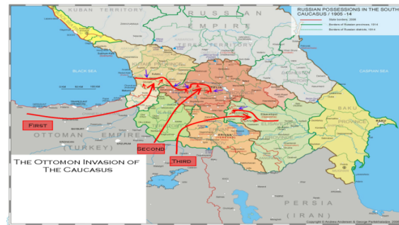
Figure 1. Map of the Invasion of the Ottoman Empire Army in the Caucasus War

The Ottoman Empire troops attacked the Russian defenses at Sarykamysh and subsequently on 17 December 1914 captured the city of Kars. Then on December 22, 1914, the next attack was successful thus the Ottoman army managed to occupy the city of Ardahan. This was succeeded by the Ottoman army due to the fact that about 65,000 Russian forces were pulled back to face the German forces. The Ottoman army was defeated at Sarykamysh by the Russian army and only 12,000 men were left due to the war in the extreme weather (Arifian, 2020).