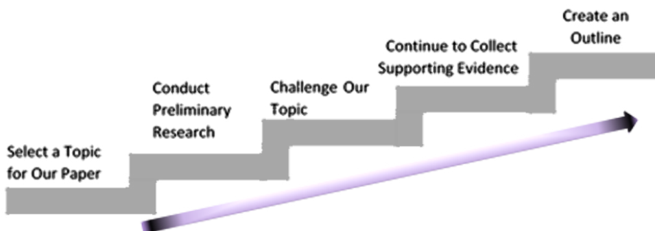
Figure 1. The Steps in Presenting Position Paper (Fleming, 2020)

This paper is part of a position paper (PP) in which the writers tailored their ideas based on their experiences and literature review. A PP must establish a merged voice in areas where controversy occurs based upon numerous practices. Typically, “a PP should elucidate the knowledge gap, followed by an evidence-based review of options, leading to an endorsed position” (Bala et al., 2018). A PP should represent more than the views or consensus of the writers but should present current thoughts and practices. According to Fleming (2020), there are at least five steps in presenting a position paper, as illustrated in Figure 1.