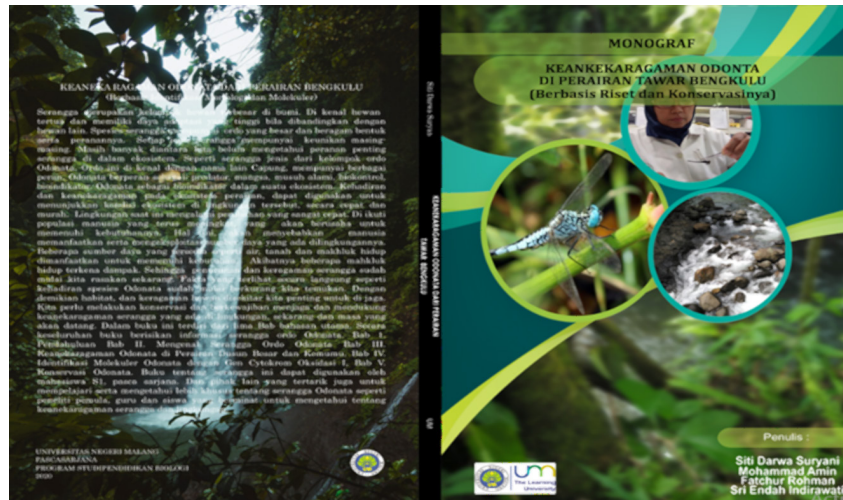
Figure 1. Monograph

The data collection techniques used in this study are pretest and posttest, which are analyzed descriptively. Hypothesis testing was performed using ANCOVA. However, before testing, the hypotheses and data were analyzed using the normality test of the One-Sample Kolmogorov-Smirnov Test and Levene's Test of Equality of Error Variances homogeneity.