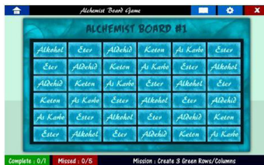
Figure 2. The Game Board of Chemistry Board Game / AI Chemist Knight

The game called Chemistry Board Game or AI Chemist Knight is an educational game in the form of board game. On this board the learners will get the material and practicum as well as exercise questions that are appropriate with the material. Learners win the game if they have makee a straight/vertical/horizontal line on the board and they create at least three interconnected lines. This is the rule of the game to be followed. Game board images are presented in Figure