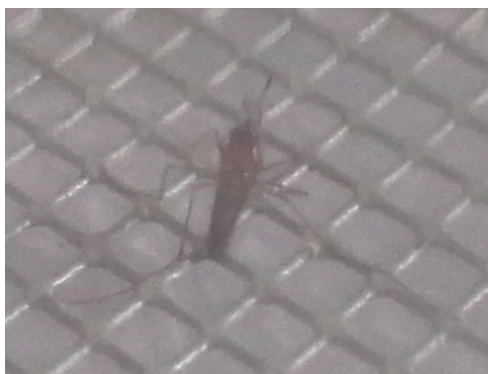
Figure 2. Mosquito Cannot Fly Anymore Caused by Active Compound of Basil Leaves Extract

and the body would stiff with brownish color. In this concentration the process of death was faster compared to 10% and 5% intervention. At 45 minutes observation, the mean death was 20 mosquitoes.