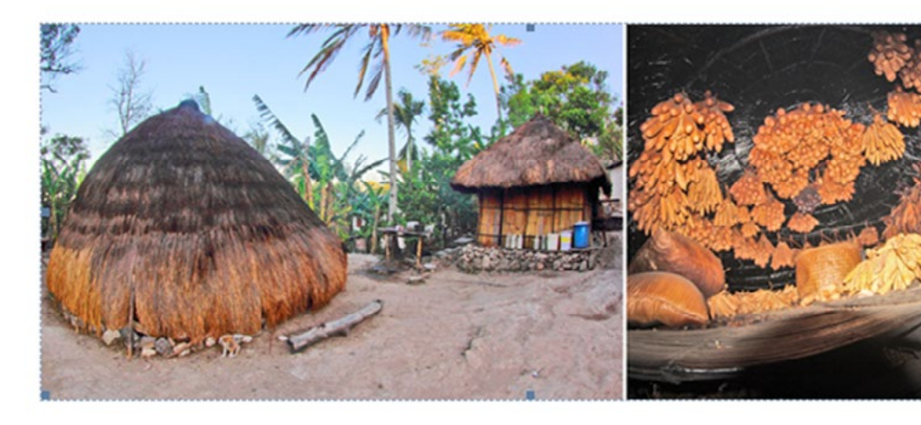
Figure 1. Ume kbubu and box home (left), warehouse storage in the attic of ume yields kbubu (right).

Women in Timor Island cannot be separated from ume kbubu . Ume kbubu is attached to women as a symbol and the construction of the role of women in all the activities in Timor Island. Women will