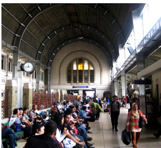
Figure 4. Suasana di bagian dalam stasiun Jakarta Kota

The hall area, a large open space area in the center of the building is left empty without any activity. This building actually has a high aesthetic value because of the concrete construction that forms the ceiling into a curve and the use of graded yellow vitrum. The middle part of the building is the most “alive” area due to public activity of using the railroad transportation. In addition to counters, platforms, and waiting rooms, there are also some spaces for rent for: mini markets, fast food restaurants, and banks. Indonesian Railway Company uses other rooms as offices. There are 12 railroad tracks in this section that will take passengers to Bogor, Merak, Bekasi and other cities in Central Java and East Java. As a terminus station (start and end), this part of the building is always crowded with passengers leaving and arriving. The construction used in the front building is concrete, and steel in the middle area. Both the concrete and steel construction in the Jakarta Kota Station building showed the expertise and accuracy of the designer because the building became sturdy and magnificent even after decades passed. Despite its strong and sturdy characters, the use of steel construction to support the ceiling does not cause a stiff impression.