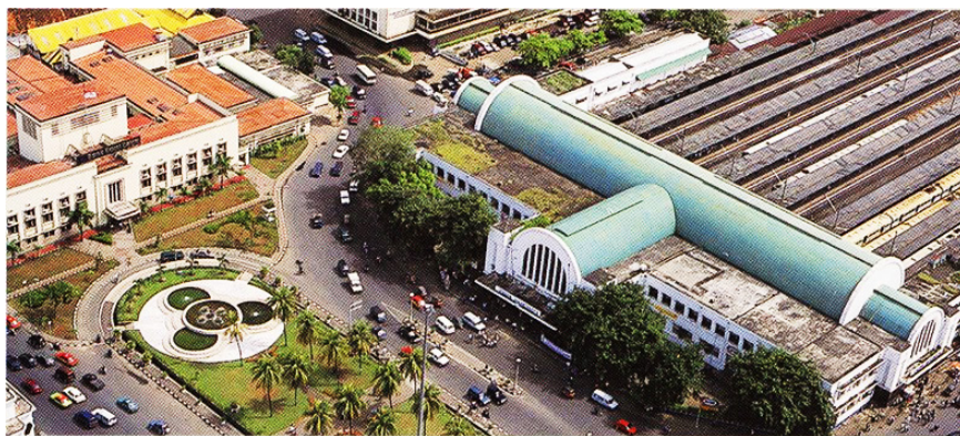
Figure 3. Jakarta Kota Station from above