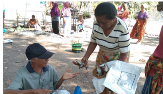
Figure 1. a mother from Lamalera doing a barter transaction with a farmer from Snaki village

Upon arrival at the market ( fule ), the people of Lamalera immediately prepared to make a du-hope transaction. Everyone should not directly do barter transactions. Usually, the people of Lamalera will take the initiative to start seeing what items will be exchanged. Every person has an acquaintance or relative ( prevo ) who will carry out transactions more intensively and correctly. When all the traders are ready, especially when those from the village of the farmers have arrived with their wares, an officer will blow the whistle as a sign to start the barter transaction ( du-hope ). The noise is immediately welcomed by the people of Lamalera to do a du-hope deal.