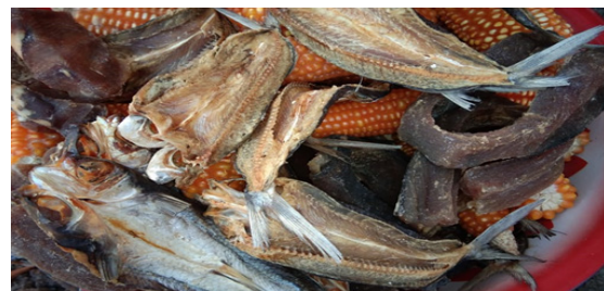
Figure 2. Fish is prepared to be swapped with corn or sweet potatoes from the mountains