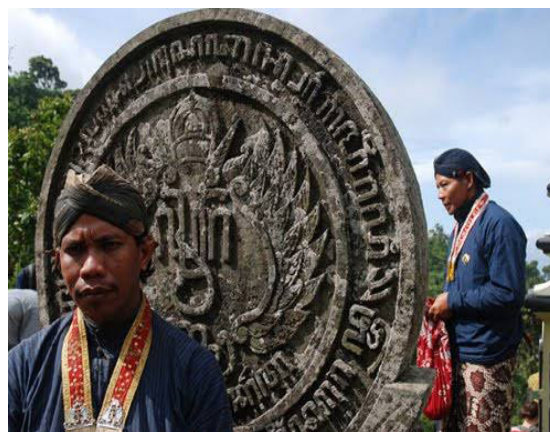
Figure 2. Timanganti