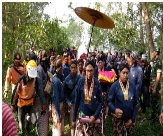
Figure 1. The Journey to Timanganti

The night before the traditional ceremonial procession of Labuhan Merapi began, the people around precisely at the house of the Merapi Mountain's careather (in Javanese called Juru Kunci ) held a congratulatory ceremony, called Kenduri . In the process of the Kenduri there is a tetembangan that is read by the Juru Kunci . The tetembangan tells the traditional ceremony of Labuhan conducted every year held at Parangkusumo Beach, Mount Merapi, and Yogyakarta Palace. Labuhan was intended to send "something" to the Merapi supporters. Labuhan is also intended to ask God for salvation and apologize for the sins committed in previous years and ask that the victims of mount Merapi eruption be forgiven and receive the blessing of glory in the Hereafter.