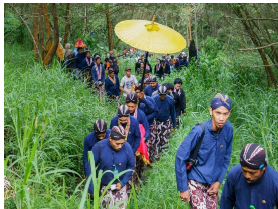
Figure 3. The Journey to Bangsalsri Manganti