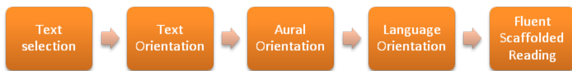
Figure 3. Text strategy in language learning

In the learning strategies, I develop each session into three core sections. These sections are anticipation, building knowled-