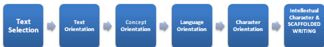
Figure 4. Text strategy in character oriented learning

From this line of learning, I develop into like this: