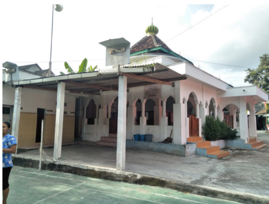
Picture 3. An-Nur Mosque in Balong District