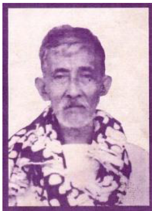
Figure 1. Ki Ageng Suryomentaram