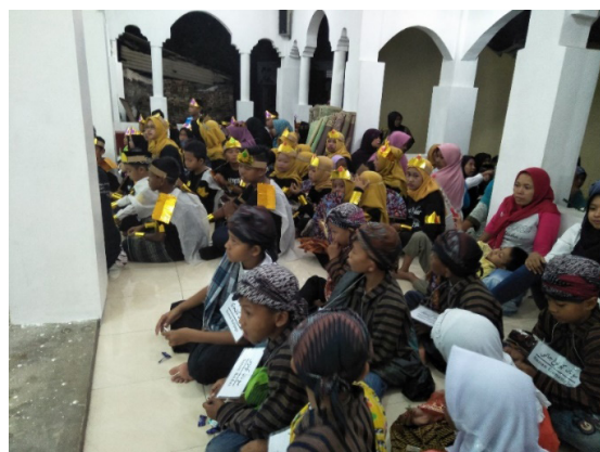
Picture 4. The activity of Qur'an reading to memorate the MaulidNabi Muhammad SAW by children, adolescent and the old in Balong District (D/Sa)

"When the goodness has been taught to children, they will automatically think and act properly."