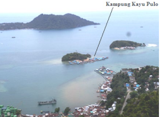
Figure 2. Native settlements of Jayapura: Kampong Kayu Pulo (left) and Kampung Tobati (right)