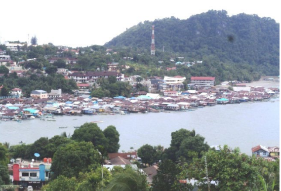
Figure 3. Settlement of fishermen on the docks IX (left) and upper-middle class neighborhood in Dok V inhabited by the ethnic mix (right)