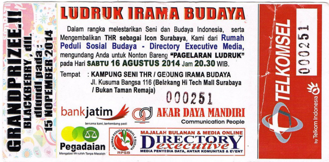
Figure 3. The Ticket of Irama Budaya in Collaboration with TELKOMSEL