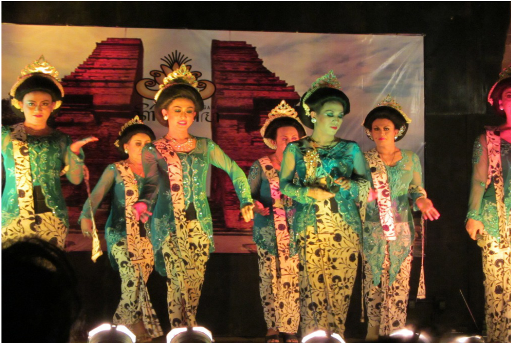
Figure 2. Ludruk Irama Budaya performs in THR

In the past, Kidung Bedhayan was sung by male players and today, it is replaced by the transgender who have artistic talent. 4 According to the observations made by Aribowo et al (2012: 79), one of the reasons why many transgender become Kidung Bbedhayan is the increasingly open/public tolerance for transvestites and the transgender nature which is not easily offended by criticism of fellow transvestites on stage.