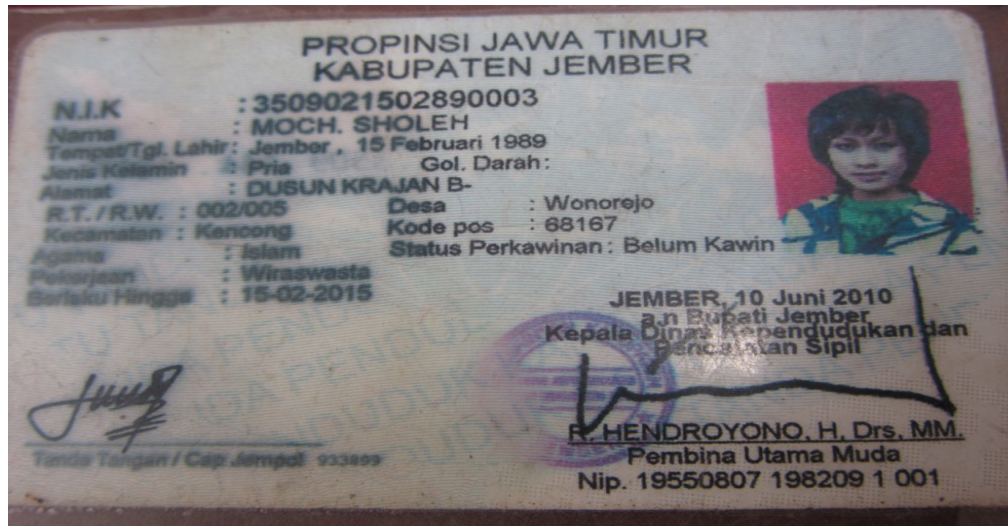
Figure 5. The Example of ID card of Transgender Ludruk Artist Irama Budaya