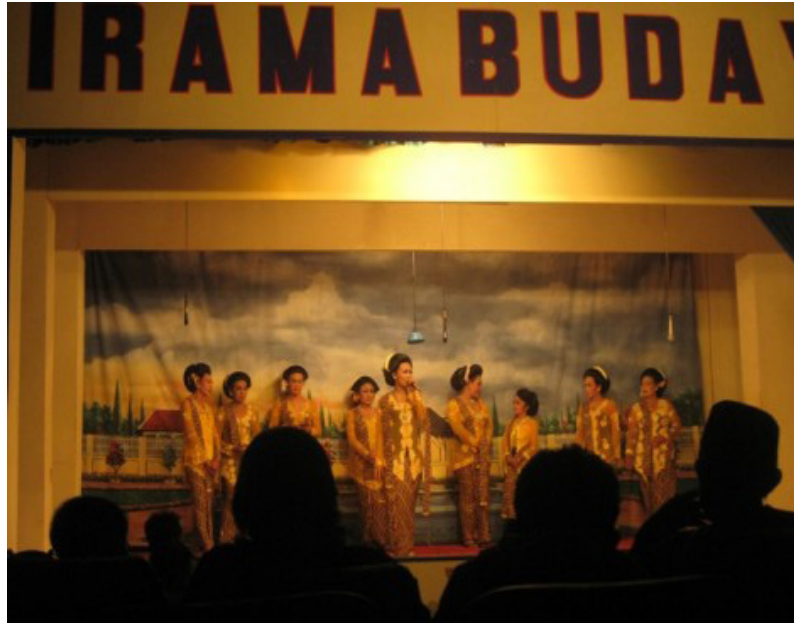
Figure 1. Performing Artist of Tandhak Ludruk Irama Budaya in THR

tage. The world of stage is an arena of aesthetic activity to express the values that are subjectively believed by every individual. The world of stage is also a means of self-actualization for transgender artists so that they feel socially acceptable by the public. Therefore, even if the world stage does not satisfy them economically, they will perform as good as possible. Through their ability to dance, slapstick and parikan , the audiences will be entertained and satisfied 3 . James L. Peacock (2005: 261) states that slapstick and kidungan has a social function and psychological importance as communicative events that reflect the moral values which they believe to be the true. So far, parikan and kidungan shown in the Irama Budaya is more entertaining for audience and yet has not incorporated educational elements mainly related to HIV and AIDS.