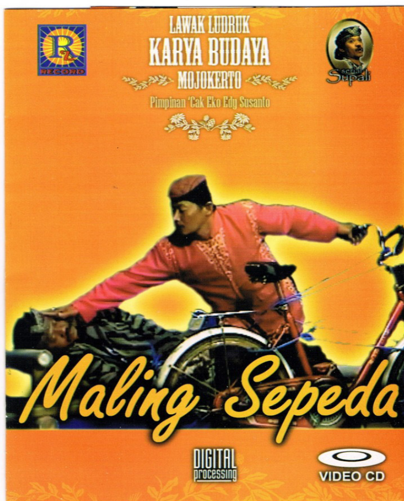
Figure 6. Story Innovation of Ludruk Karya Budaya

both for the sustainability ludruk also for society in general.